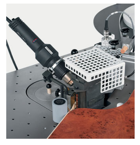
Additional heating unit (optional) To pre-heat thick PVC-edges.