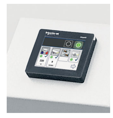
Intuitive operation via 3,5" touch display.