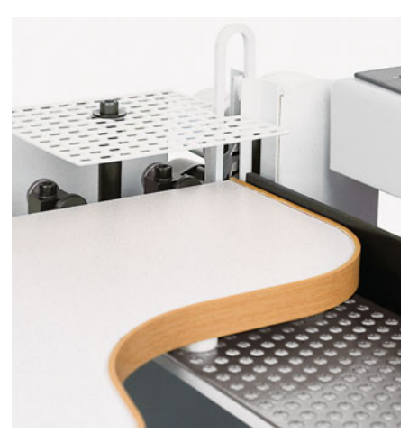
End trimming unit EK 13 for EDGETEQ T-100 and EDGETEQ T-200 (optional) For the exact end trimming of overhanging edge materials on shaped and straight workpieces.

Modern 12.000 rpm trimming motors, based on frequency-inverter-technology for maximum output.