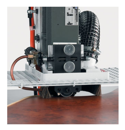
Contour-trimming Constant trimming results through the use of precise ball bearings to trace the workpieces..